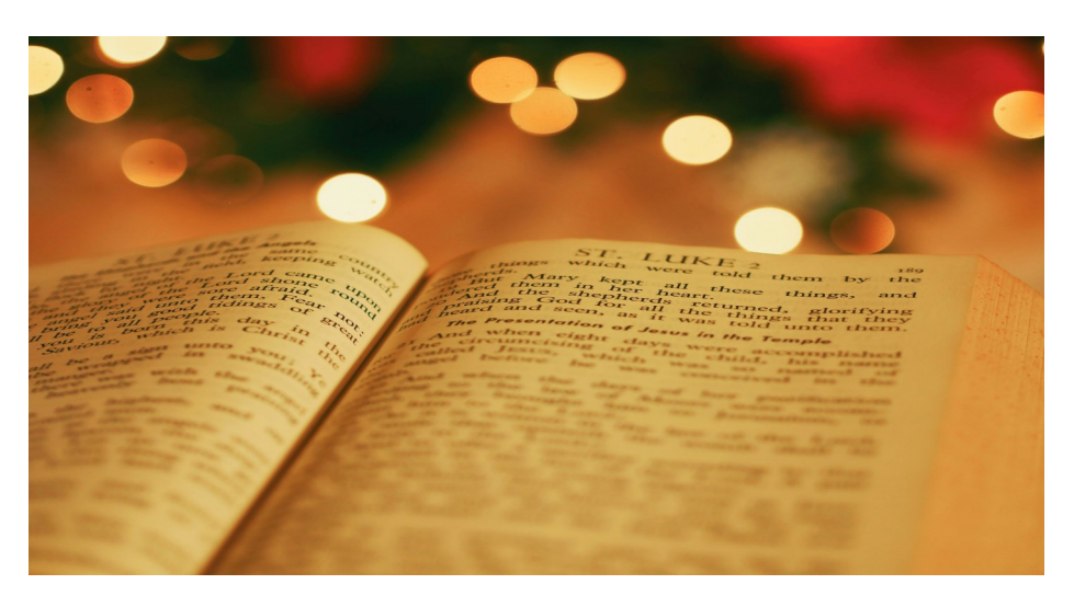
Let's look at the salvation story through the eyes of women.