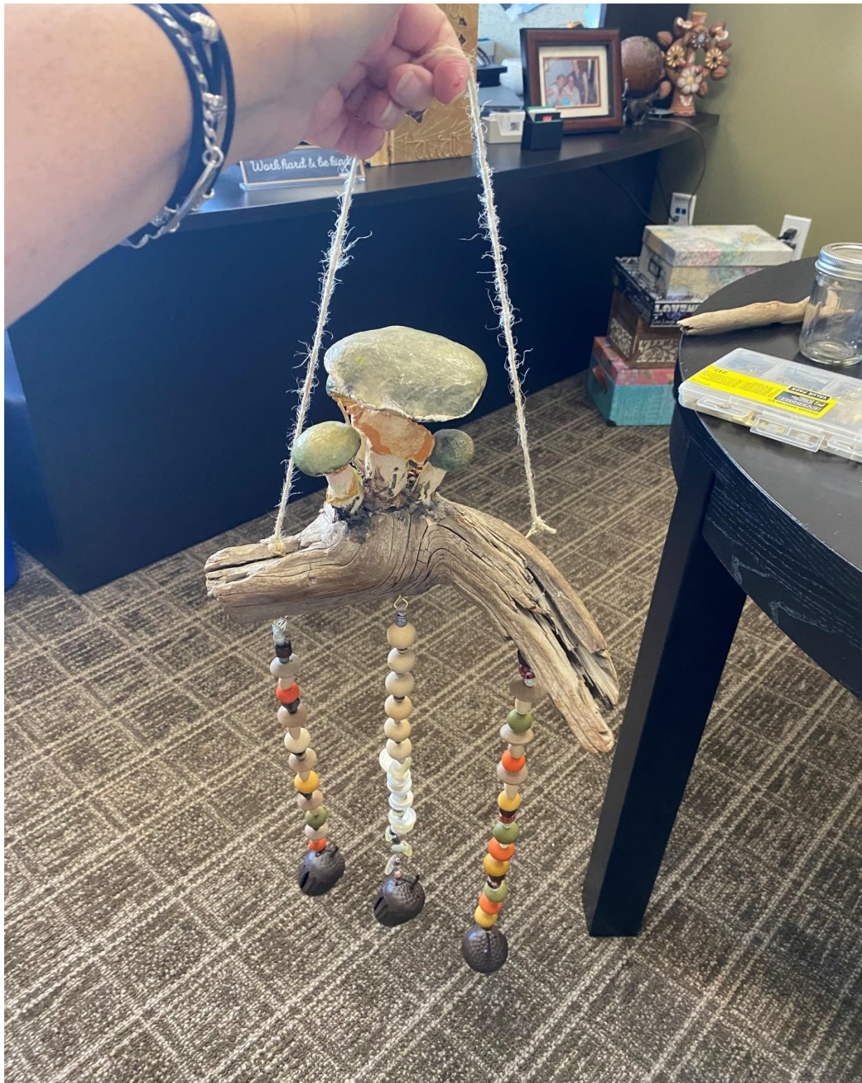
This is the finished project. I really like it. It is fun and a bit funky like me.