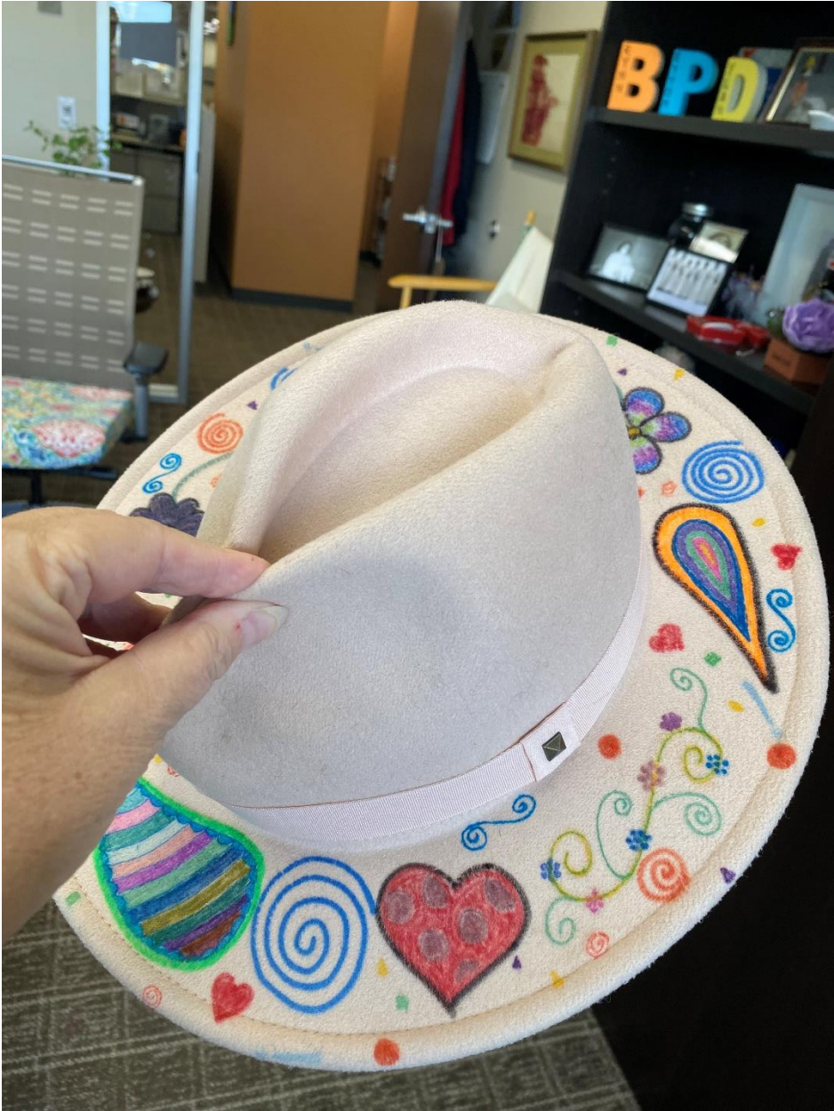
I also made a dirty felt hat into something fun to wear. I used sharpie markers and hairspray to set it.