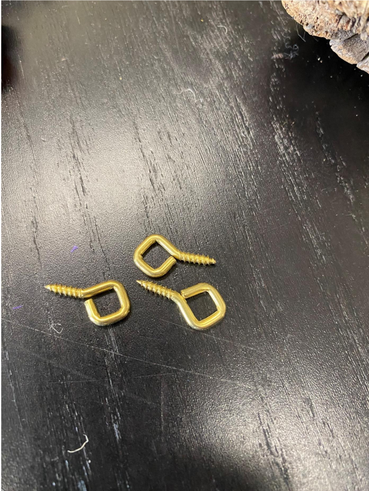
For attaching the beads.