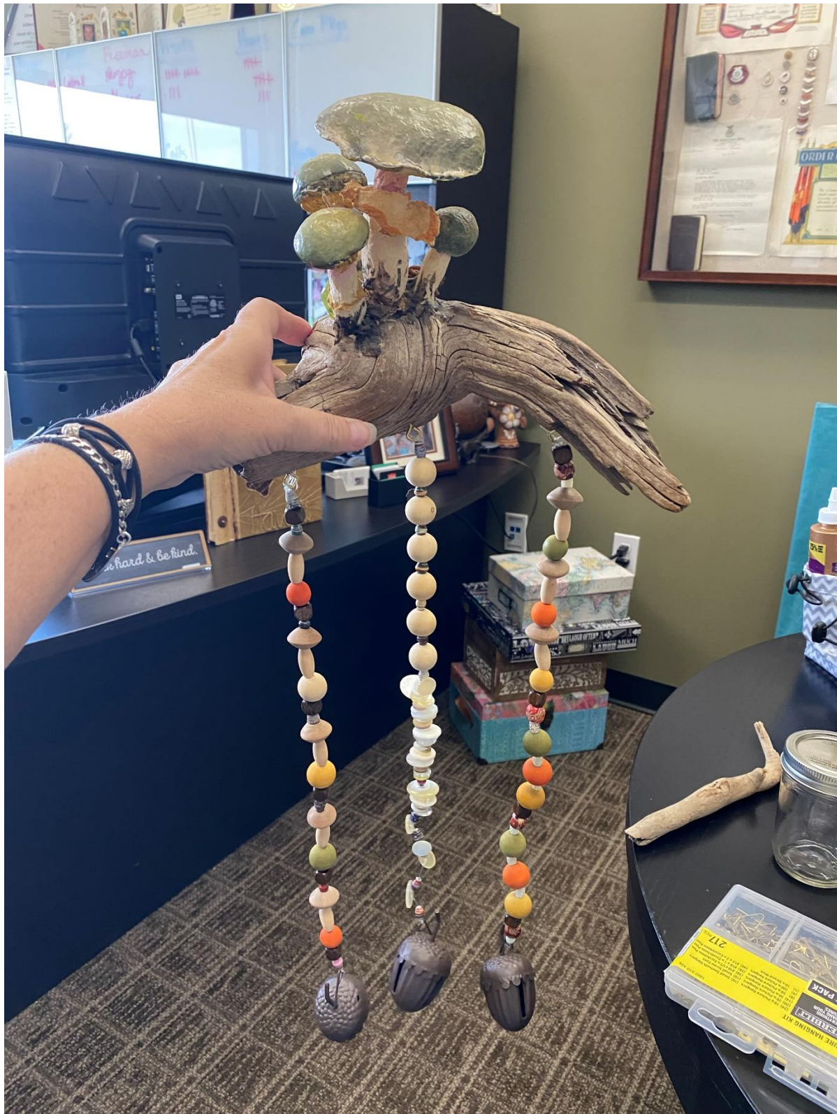
The bells were half price at Hobby Lobby and on a garland of their own. I cut them apart.