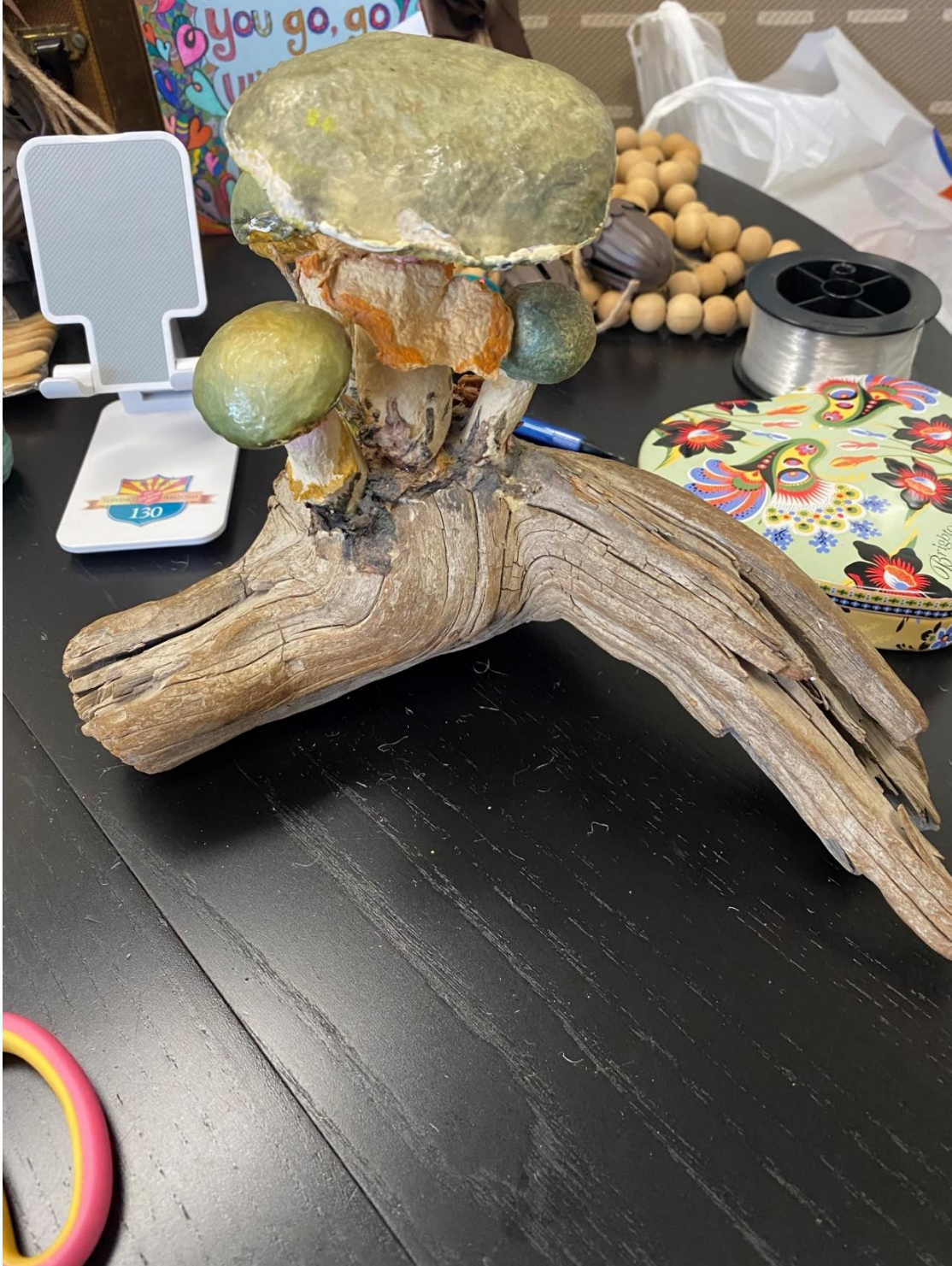
This is what I found and wanted to make into something I liked. I paid $3.00 for it.