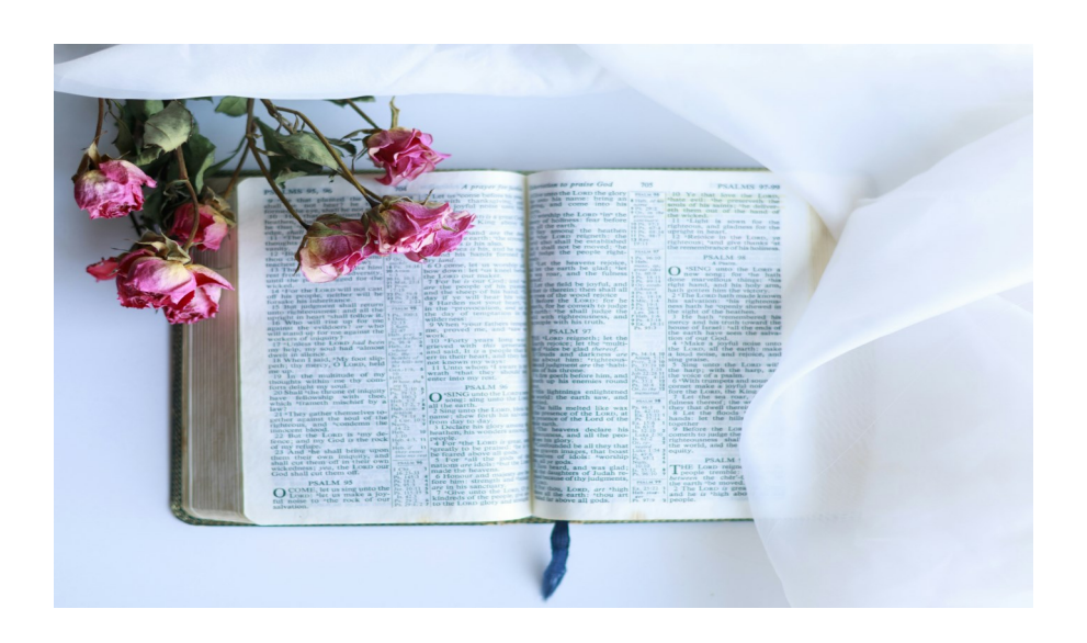
See what the Bible has to say about confession of sin.