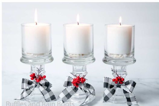
Ruffles and Rain Boots

Brighten your home and your holidays with these simple candle crafts. Share them as gifts of hope to someone who needs a little encouragement this Christmas season.